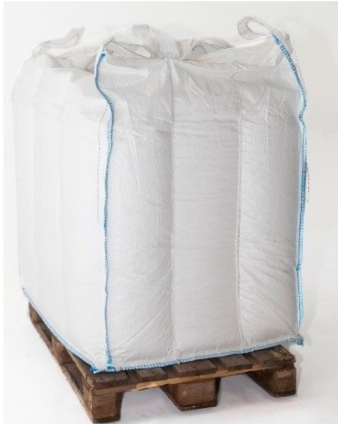
Big bag (~1000 kg)